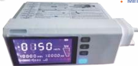
DIAZ SP 01